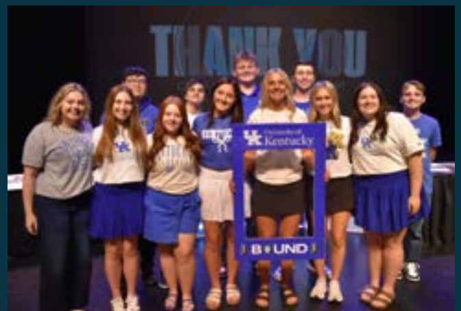
MCHS Seniors celebrate at Senior Decision Day 2025