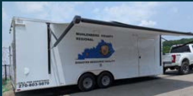
Mobile Disaster Resource Trailer