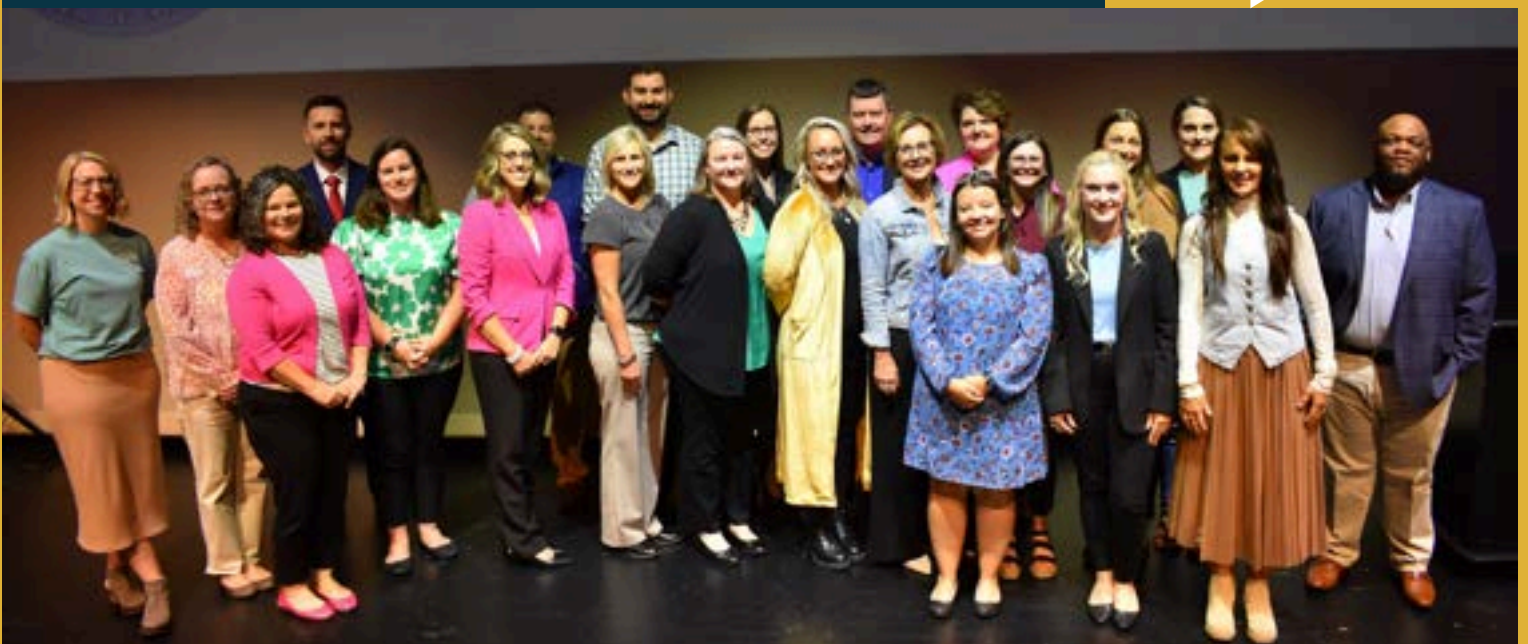
Muhlenberg Civic Leadership Institute Graduates - Class of 2024