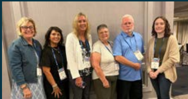
Champions & Celebrate Recovery Volunteers at national training