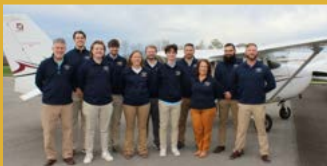
MCC's Aviation Training Hangar Opens