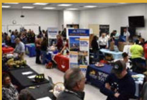
Career Fair at MCHS