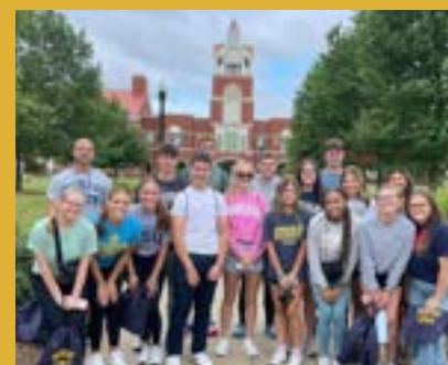
Murray State College Tour