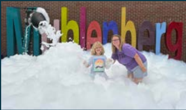
Special Needs Day at Muhlenberg County Fair