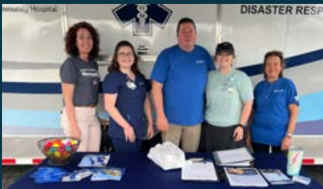
Champions Drug Take-Back Day